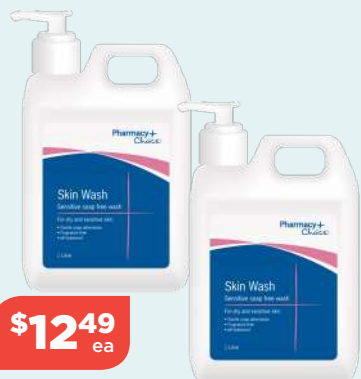
Pharmacy Choice Skin Wash 1 Litre