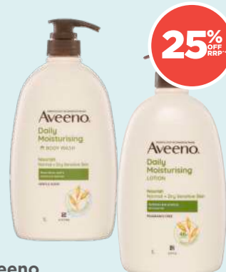
Aveeno Skincare Range (Selected Variants)