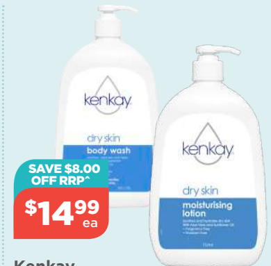
Kenkey Dry Skin Body Wash or Moisturising Lotion 1 Litre