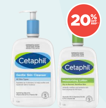
Cetaphil Skincare Range (Selected Variants)