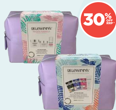
Dr Lewinn's Range (Selected Variants)