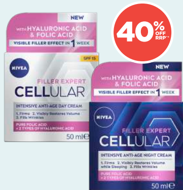
Nivea Skincare Range (Selected Variants)