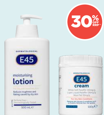
E45 Skincare Range (Selected Variants)