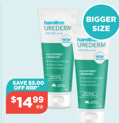
Hamilton Urederm Cream 225g