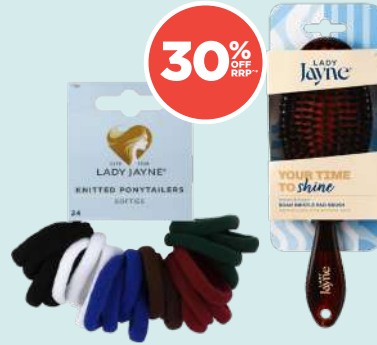
Lady Jayne Hair Care Range (Selected Variants)