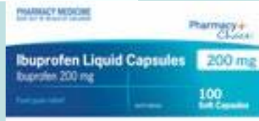
Pharmacy Choice Ibuprofen Liquid Capsules 200mg 100 Soft Capsules

Always read the label and follow the directions for use. Incorrect use could be harmful.