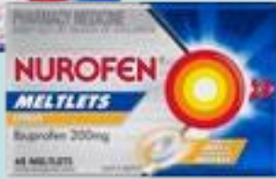
Nurofen Meltlets Berry Burst or Citrus 48 Pack

Always read the label and follow the directions for use. Incorrect use could be harmful.