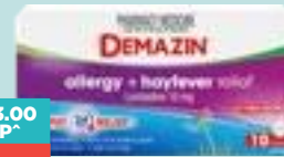
Demazin Allergy + Hayfever Relief 10 Tablets

Always read the label and follow the directions for use.