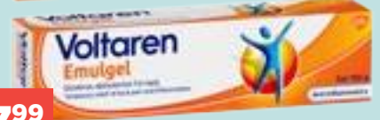
Voltaren Emulgel 150g

Always read the label and follow the directions for use.